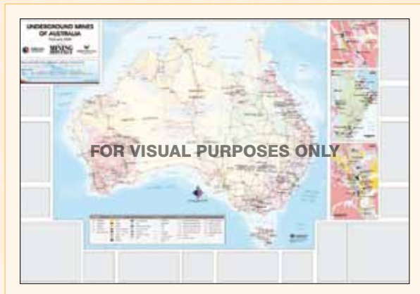
Map Size: 690mm(h) x 1000mm(w)

T: +61 8 6263 9100 F: +61 8 6263 9148 E: advertising@miningmonthly.com