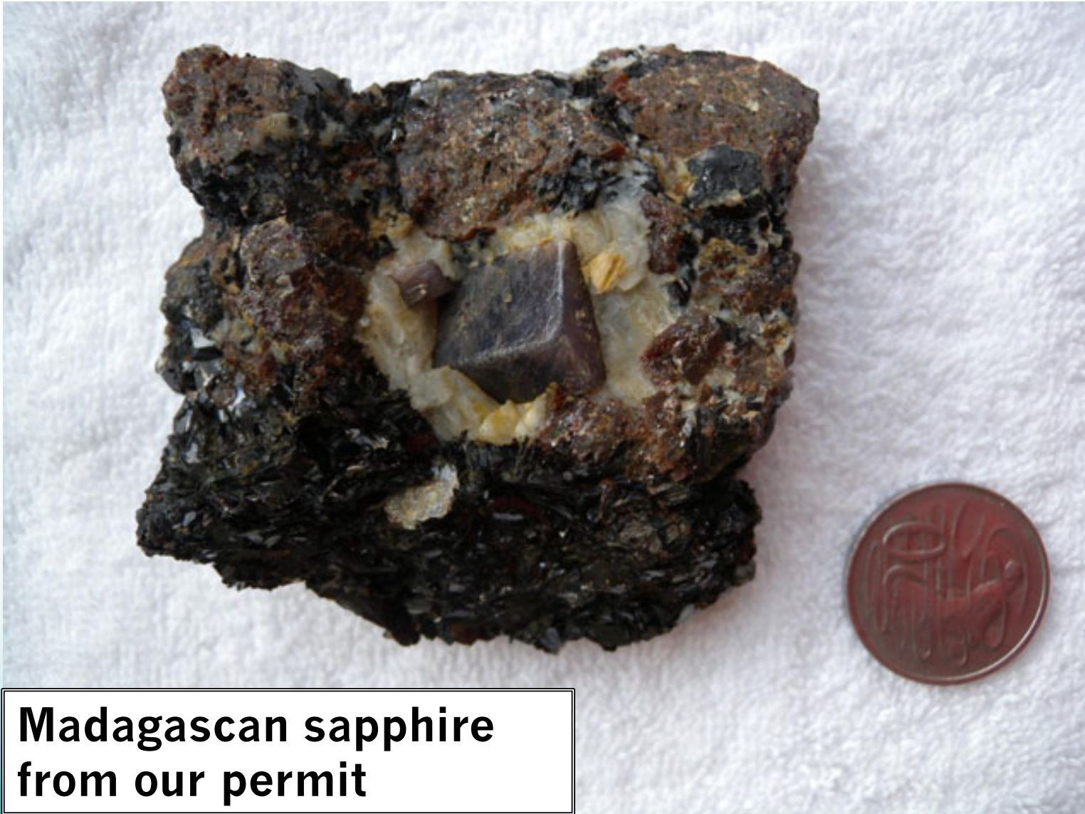
Madagascan sapphire from our permit